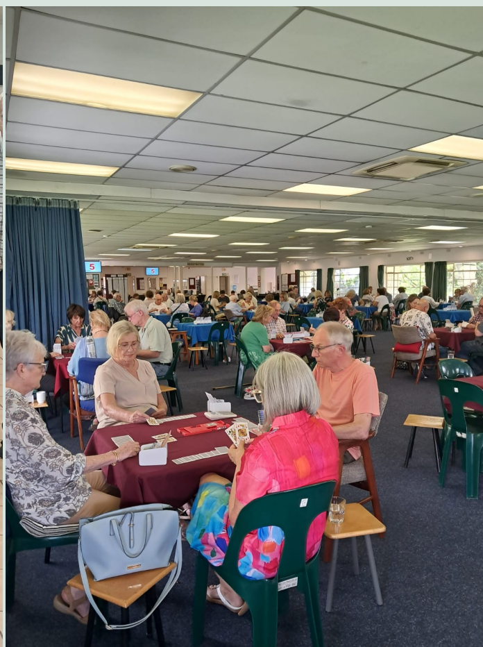
Full the hall with 118 players.

(Rumour has it these two ladies play a lot online but have rarely been seen live at their local club The Links)